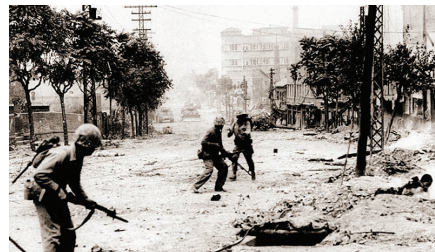
Fighting in Seoul, capital of South Korea, during the war.

by recruiting Chinese to work against their government.