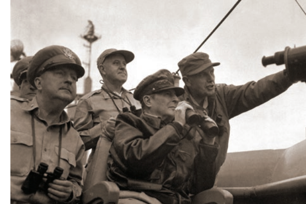
US General Douglas MacArthur observes from a Navy ship as American forces bombard communist targets in Korea.

There was, however, one significant difference. In Europe, most people hated the Nazis. In post-war China, the general populace was not necessarily so adverse to the new communist system. (Communism always sounds nice at the beginning, before the population begins to suffer from its inherent vices, such as totalitarianism and grinding poverty.) They also had little trust in foreign governments, their agencies and agents.