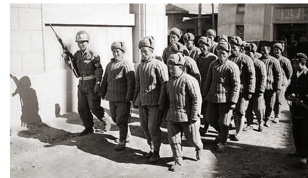
Chinese Communist troops captured in South Korea during the war.

In short, the plan to enlist a fifth column in communist China was strategically flawed from the outset. Still, the CIA was determined to forge ahead with a plan no matter how unrealistic.